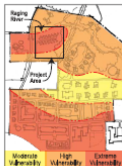
Town of Hazardville Composite Loss Map developed previously during risk assessment (see FEMA 386-2).

Losses avoided by acquisition and demolition of flood-prone structures