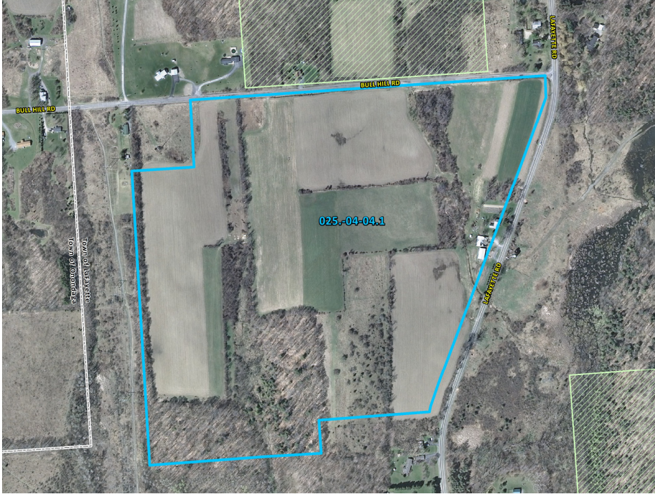
Town of LaFayette parcel 025.-04-04.1. Parcels currently in an Ag District are hatched.