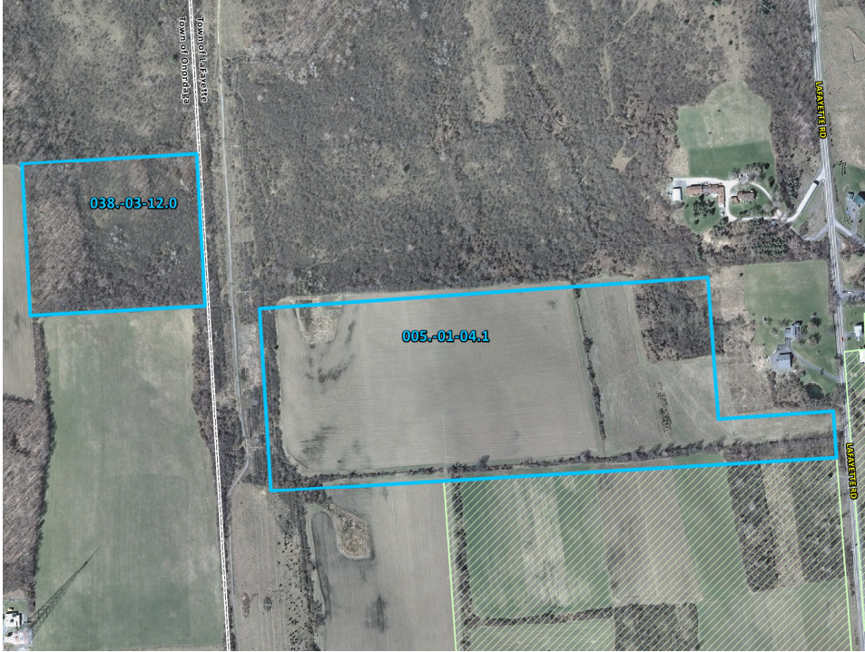
Town of LaFayette parcel 005.-01-04.1 and Town of Onondaga parcel 038.-03-12.0. Parcels currently in an Ag District are hatched.