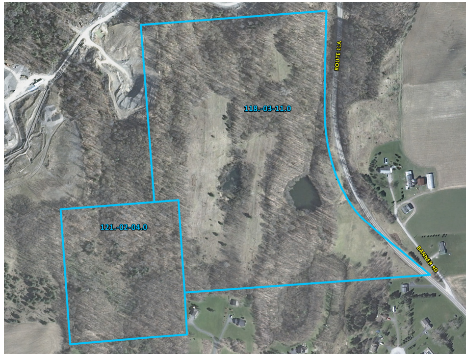
Town of Tully parcels 118.-03-11.0 and 121.-02-04.0.