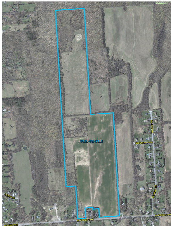
Town of Marcellus parcel 012.-01-81.1. Parcels currently in an Ag District are hatched.