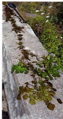
Each seed can produce up to 15 stems