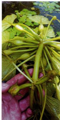
Each plant can produce up to 15-20 seeds