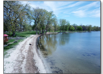
Willow Bay, at the northern end of Onondaga Lake, is among the sites being considered for a possible beach.

Three potential beach sites were identified within Onondaga Lake Park. These locations were determined by factors such as land use restrictions, physical constraints, and water depth.